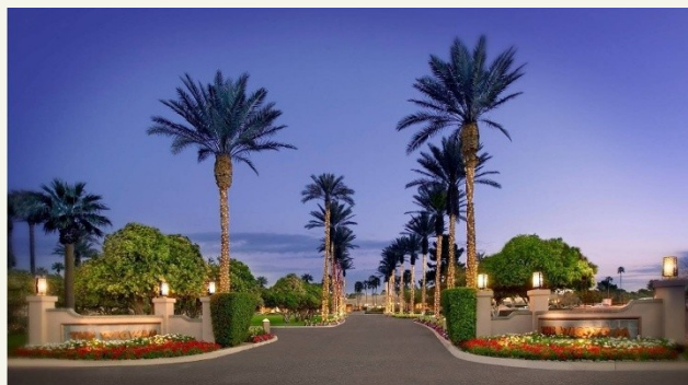
"Authentic Arizona™ - An Unparalleled Experience awaits you at the Wigwam Golf Resort and Spa..." Pictured above is the entrance to the resort.

When Good-year Tire and Rubber Company discovered that long-staple cotton extended the life of the tire, the company purchased 16,000 acres of Arizona land in 1916 to begin cultivating cotton. The first building on the site was established in 1918 by sales reps supplying equipment to the ranchers, and was known as the "Organization House." Many of the guests staying on business suggested that it would be a great place to spend a winter vacation. Goodyear executives agreed, and on Thanksgiving Day in 1929 "The Wigwam" officially opened its doors as a guest ranch with enough rooms for 24 guests. A portion of the original structure remains as the cornerstone of The Wigwam's authenticity and southwestern charm.