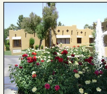
Pictured above: One of the 331 Guest Casita's on the property. Pictured right: a small glimpse of the beautiful rose gardens.