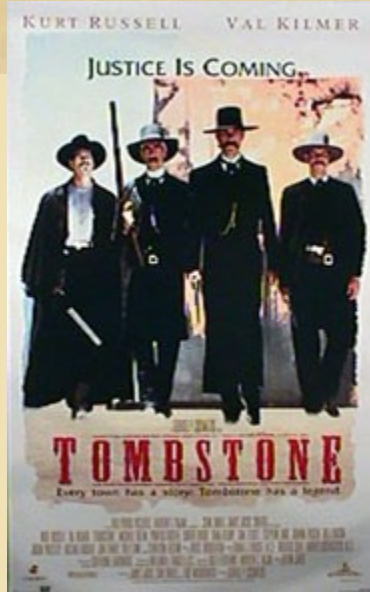
Movie poster from Tombstone, filmed at the famous Old Tucson Studios.

From one of the Seven Wonders of the World - the Grand