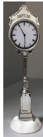
NCC Silver Anniversary Clock

Please note that the images are not to scale and colorization may be slightly different in the final product.