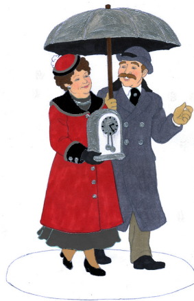
Commemorating Our Anniversary

NCC Silver Anniversary Clock: This is a special platinum paint selected just for the NCC. Where it currently says, "Dept. 56," it will say, "NCC," and the years, "1992-2017," will be on the reverse side.