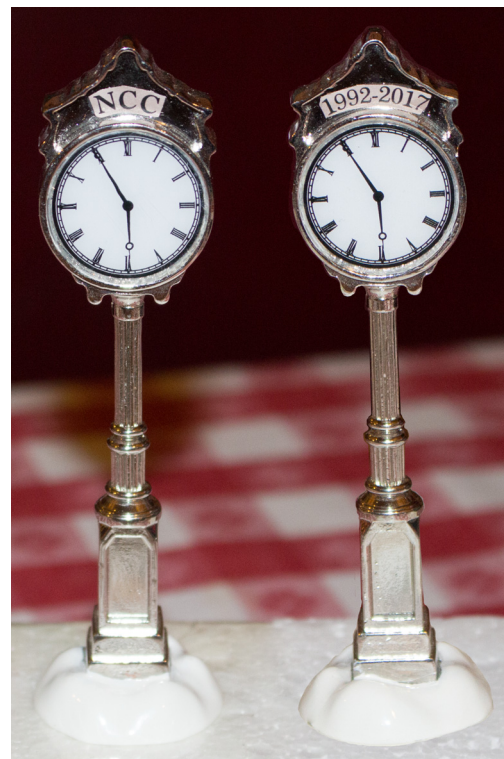
NCC Silver Anniversary Clock

Please note that the images are not to scale and colorization may be slightly different in the final product.