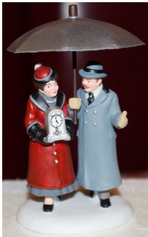
Commemorating Our Anniversary

Commemorating Our Anniversary portrays a couple under a silver umbrella carrying an anniversary clock set at “5 to 6”. The silver umbrella references the 25th anniversary and the umbrella itself symbolizes the NCC’s mission of serving as an umbrella organization for clubs. It also is a direct tie to the previously released Under The NCC Umbrella accessories and Jack’s Umbrella Shop . The NCC 25th Anniversary Clock has been specially painted in a platinum paint that was personally chosen for