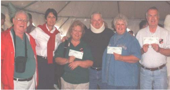
Happy Winners of Russ Country Gardens Display Contest