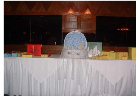
They were not finished putting out all the prizes when this picture was taken. Thanks again to Carrie's Collectible, Banner's Hallmark, Remembering You and Especially for You for there generosity.