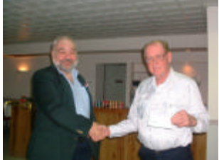
Presentation of contribution check to American Legion Commander.