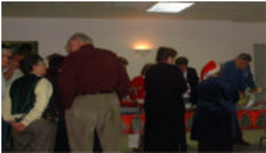
Everyone enjoyed the delicious food and each other's company.