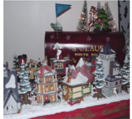
3rd Place — Barry Ebersberger

All of displays in the contest were great!