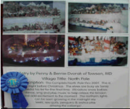
1st Place, North Pole Display: Bernie & Penny Dvorak