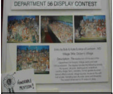
Honorable Mention, CIC Display: Dick Baker