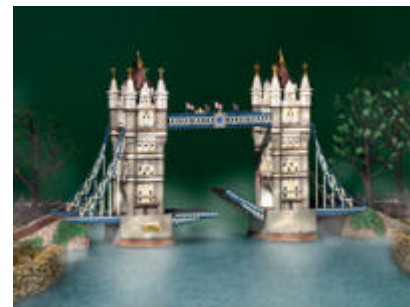
Dept. 56, The Tower Bridge

So, while the original bridge is neither Dickens' nor stone, the D56 version is still a beautiful rendition and will be a great addition to your Victorian Christmas Village ... if you have the room for it.