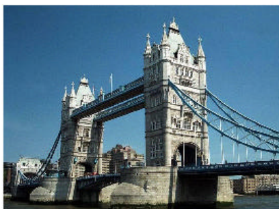
The Tower Bridge, London

The Tower Bridge was reproduced by Dept. 56 in 2004 as a Limited Edition for the Dickens' Village series. Many collectors regard the stone and masonry bridge as one of the most accurate and beautiful Dickens' pieces done by D56. But, is the real bridge made of stone and masonry? Is it from Dickens' era? The answer to both is no.